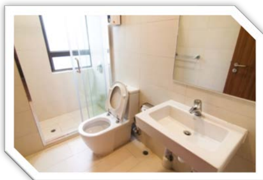
Private Bathroom of the Visitor's Flat